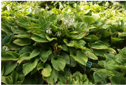
H. 'Polly Bishop'